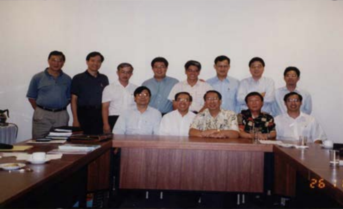
18th Board of Governors (2000)