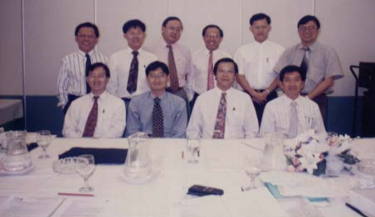
13th Board of Governors (1995)