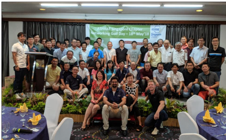
Group Photo of Golf Event 2018

On 18 th May 2018, Research Promotion committee organized a networking golf day at the Orchid Country Club (OCC). 60 people participated in the golf event. The event had the sponsorship from Durkee America Inc for the Champion Prize, 1 st runner up prize and 2 nd runner up prize. Ten table fans were sponsored by Mitsubishi Electric Asia Pte Ltd towards consolation lucky draw prizes. Golf balls were sponsored by IMI Hydronic Engineering. Door gifts were facilitated by Orchid Country Club (OCC).