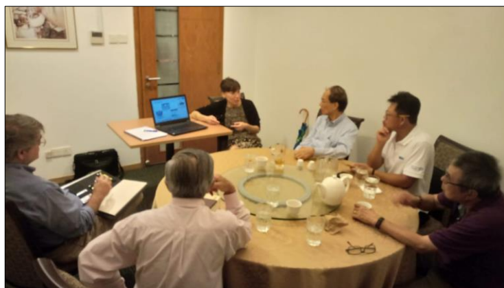
Dinner meeting with BSRIA rep from UK on 10 OCT 2018