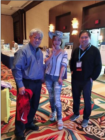
ASHRAE held its Annual Conference in Houston TX on 25 th JUN 2018.