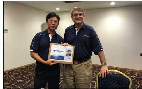
Outgoing (left) and Incoming (right) Presidents