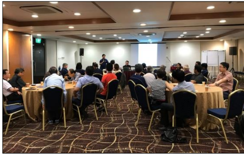
ASC Members at 36 th AGM

The 36 th Annual General Meeting of ASHARE Singapore Chapter was held on Friday 4 th May 2018 at Singapore Polytechnic Graduates' Guild.