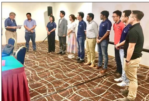
Incoming BOG Members