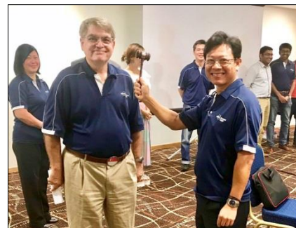
Incoming BOG Members