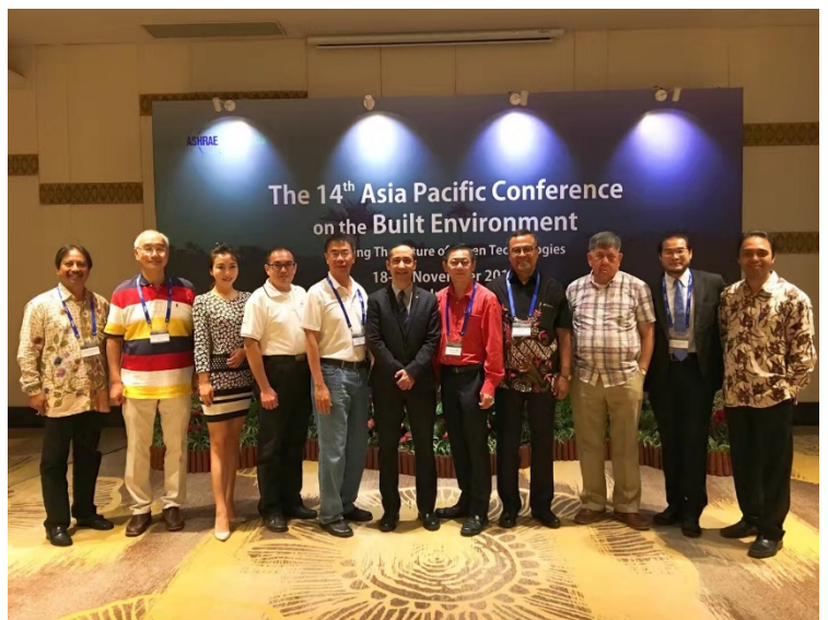
Young Engineers in ASHRAE (YEA)

The APCBE Steering committee meeting was held in the early morning the second day. The meeting summarized the achievements of the 14 th APCBE Meeting and discussed the next meeting which will be held at Taiwan in the year of 2021.