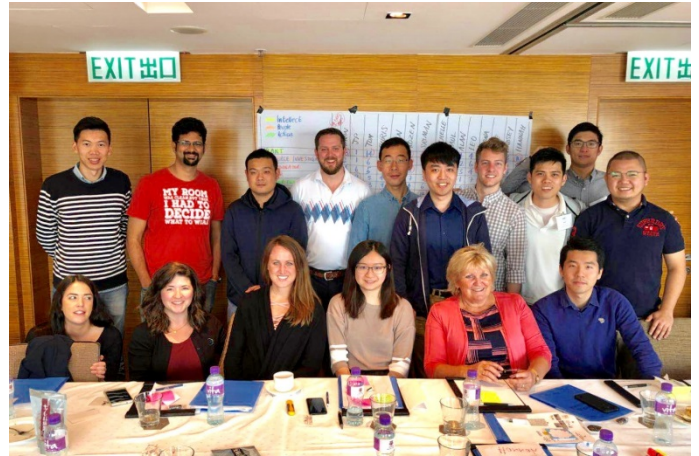
Group Photo of ASHRAE YLI 2017 @ HK