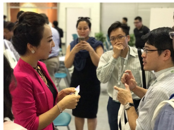
Discussion with participant