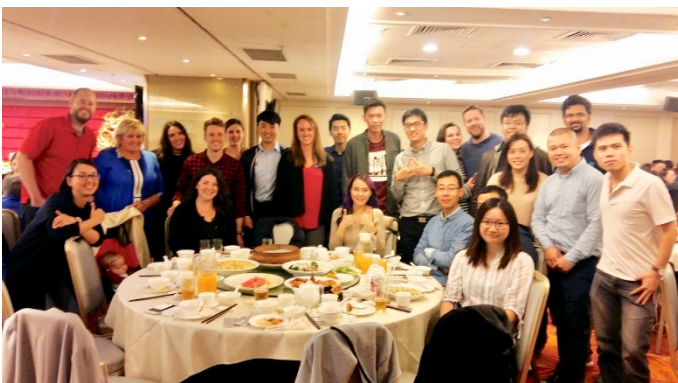
Dining with participants