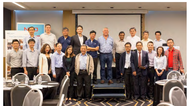
Group photo with DLs