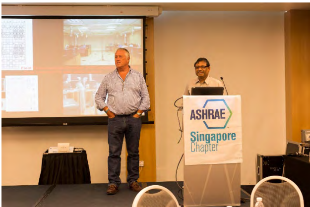
DLs Q&A Session