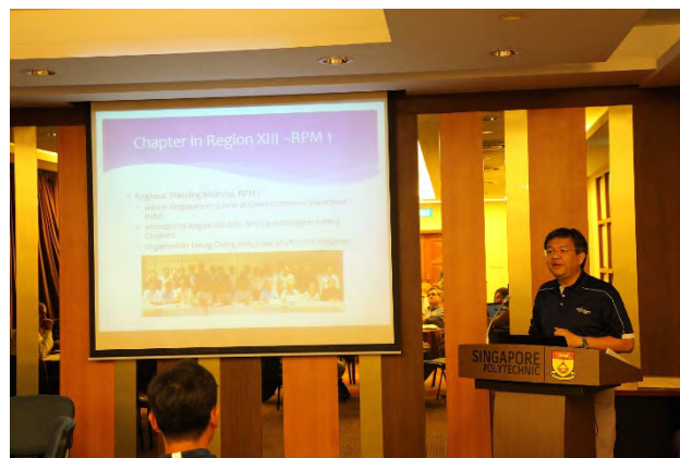
Outgoing President Report