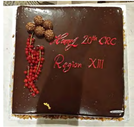
A birthday cake to celebrate 20 th CRC