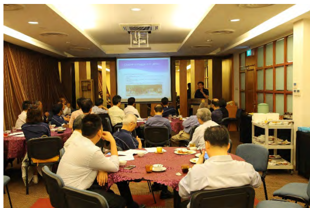
Members at AGM

The 35 th Annual General Meeting of ASHARE Singapore Chapter was held on Friday 5 th May 2017 at Tulip Room, Singapore Polytechnic Staff Centre.